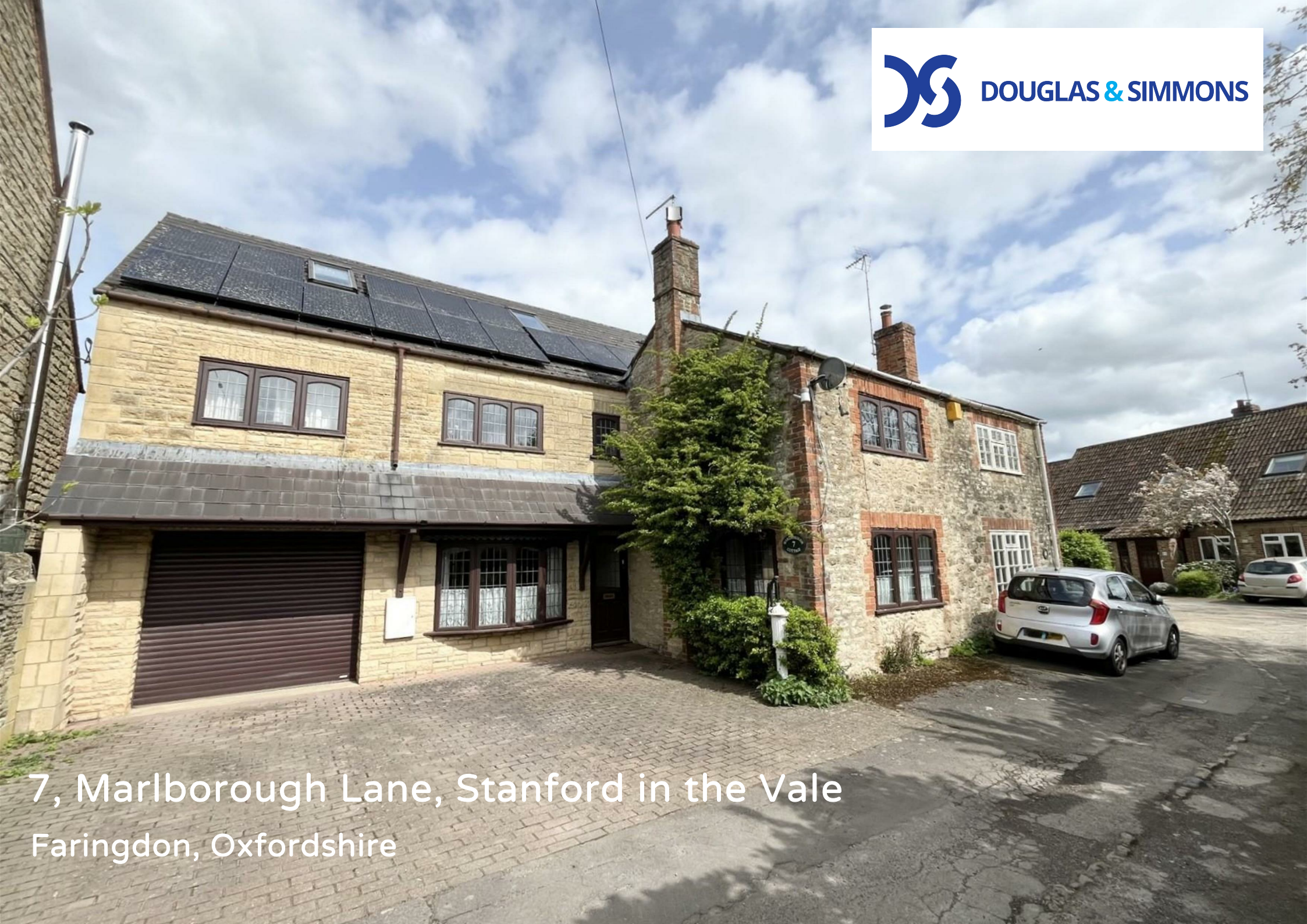
7, Marlborough Lane, Stanford in the Vale Faringdon, Oxfordshire